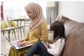
Parents Together online parenting course