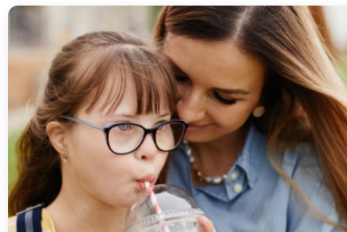
Parenting Neurodivergent Children online course