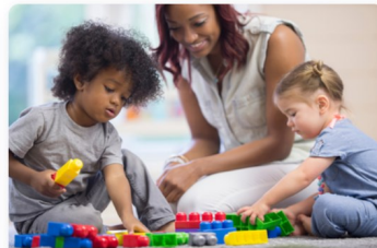
Let's Play online parenting course