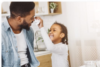
Bringing Up Confident Children online course