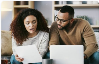
Co-parenting After Divorce or Separation online course

Free online parenting courses with certificates. All of our courses are filled with helpful techniques and ideas developed by our experienced parenting professionals to help you become a confident and happy parent. Our courses are self-guided and can be done on your mobile, tablet or computer, so you can work through it at your own pace and get a certificate when you complete it. Our range of courses are below.