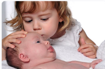
New Baby in the Family online course